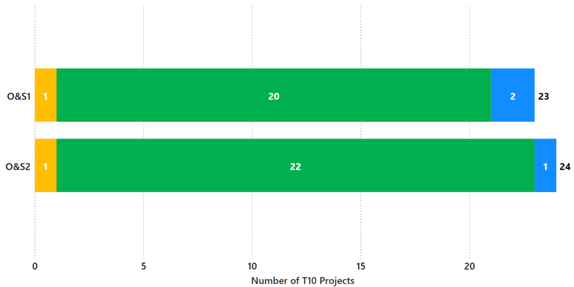
Figure 2 – Projects by Status

Project Status ● Caution ● On track ● Project completed