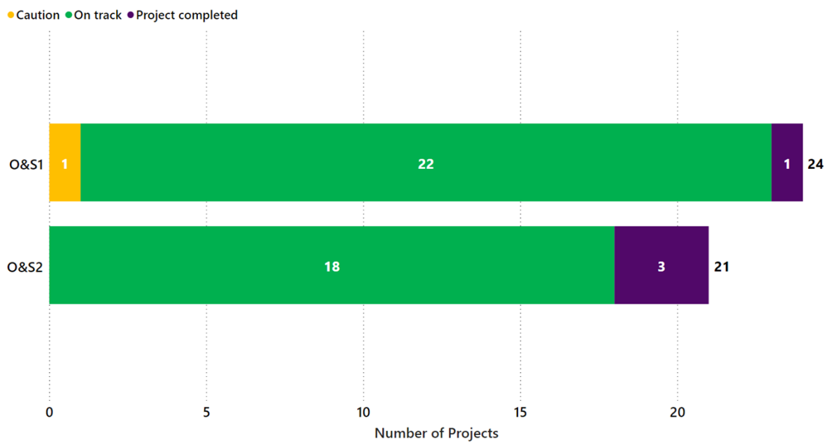
Figure 2 – Projects by Status