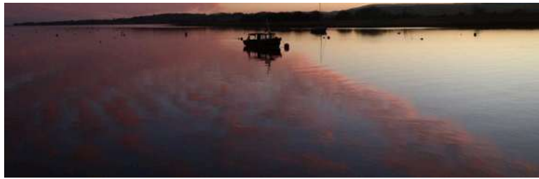
View of the Exe Estuary from Topsham Quay