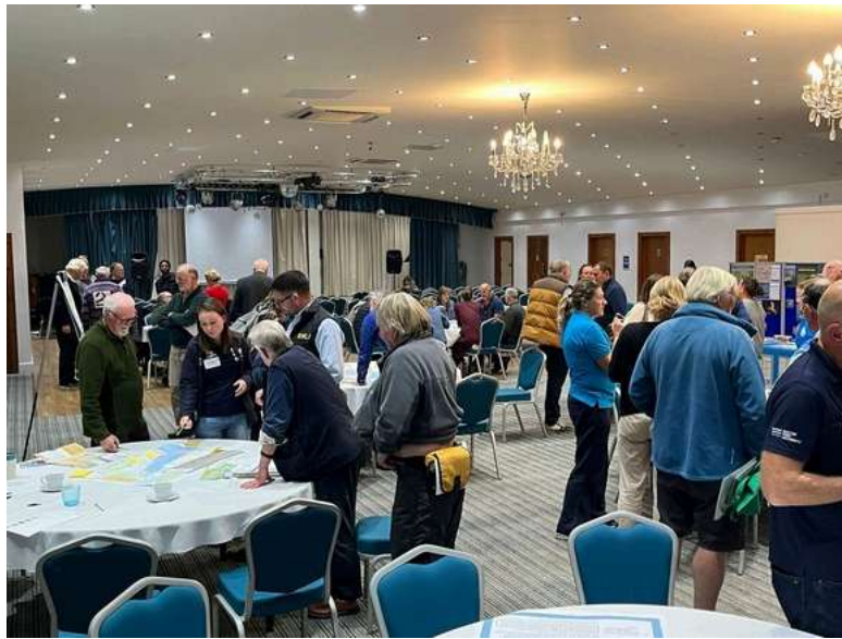
Exe Estuary Management Partnership Autumn Forum In Action

For more information or an informal discussion about either role, please contact: Exeestuary-mailbox@devon.gov.uk