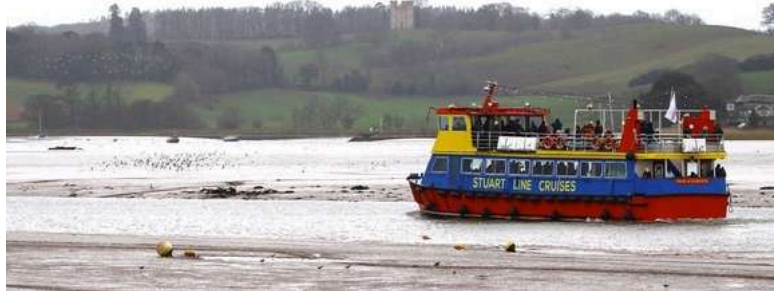
Stuart Line Cruises Guided Bird Watching Cruise

The Exe belongs to all of us, but for the winter, it truly belongs to the birds.