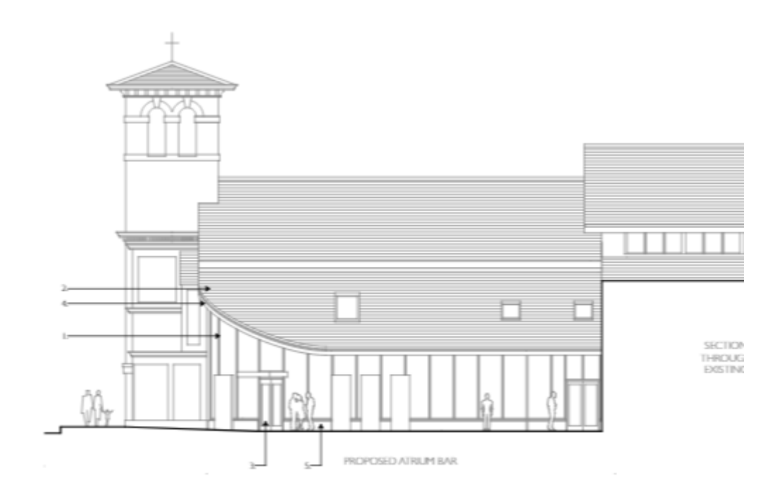
Figure 1: Extract of the proposed southern elevation drawing ref. 22.20_PL_201 REV.C